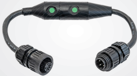
Break Away Connector